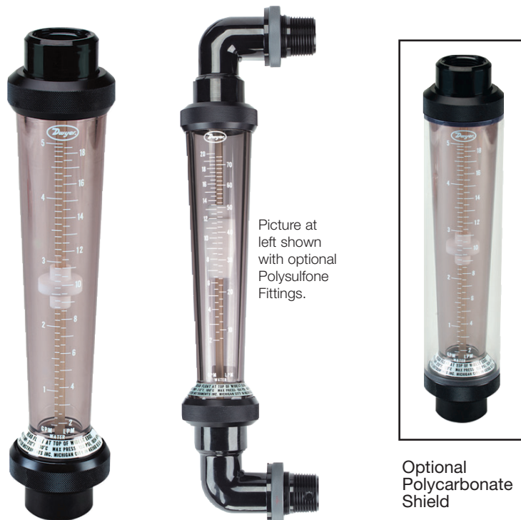
Picture at left shown with optional Polysulfone Fittings.