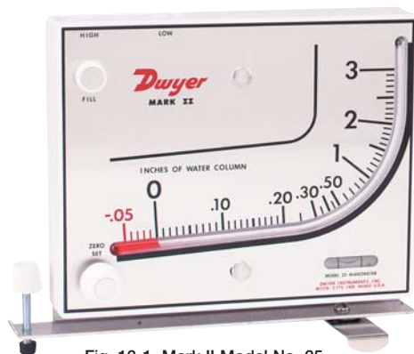
Fig. 13-1, Mark II Model No. 25 inclined-vertical manometer. (shown with optional A-612 portable stand)