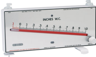
MARK II MODEL 40